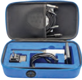
Nylon Storage Case