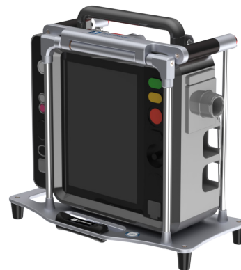
Standard Surface Base