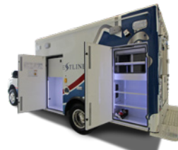
The CCL 150 offers 51.9 cu. ft. of exterior storage space.