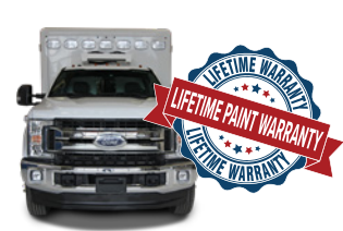
CrestCoat is a durable and cost effective corrosion prevention solution backed by a Limited Lifetime Paint Warranty.