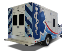
The all aluminum underbody bumper protects the module in low impact collisions.