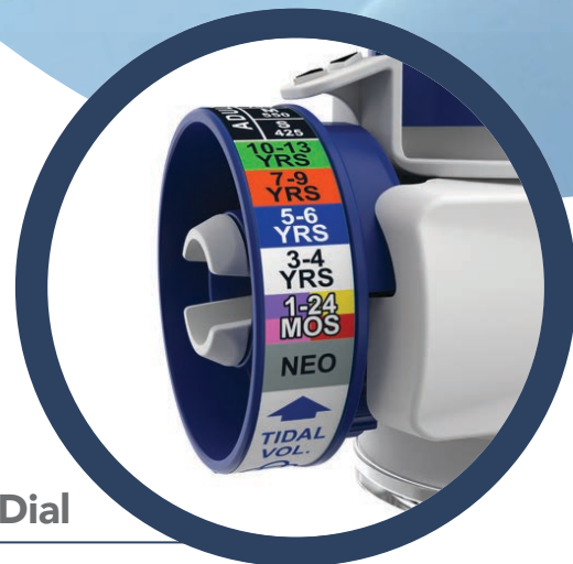
Tidal Volume Dial

Let the ButterflyBVM™ lighten your cognitive load.