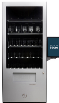
Vision ES Plus VISIONES-15

Vending machine for IT / Tech, retail, and other installations requiring branding or rich product information