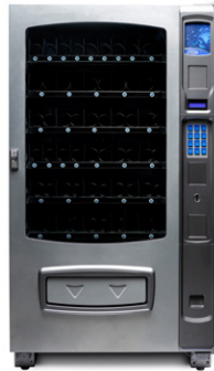
Envision Refrigerated ENV5C

Vending machine for industrial, EMS, and other ambient temperature applications