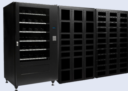
Vending Machine + Versa SmartLockers 24C + 36

Talk to us about how to combine equipment into one customized dispensing solution.