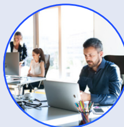
IT / Tech