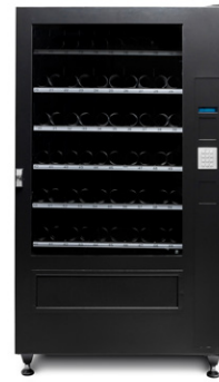
Optima Helix VN-HELIX.BK.001

Vending machine for industrial and EMS applications; stainless steel front panel