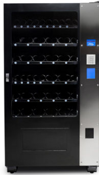
IIC Sightguard SEAVM

Vending machine for industrial and EMS applications; stainless steel front panel