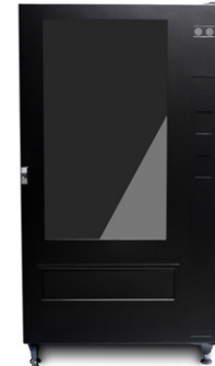
Optima Helix Touch VN-HELIX.BK.TS

Refrigerated vending machine for perishable items