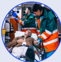
EMS / Fire / Healthcare