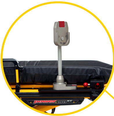
Safety MD - Transporter®