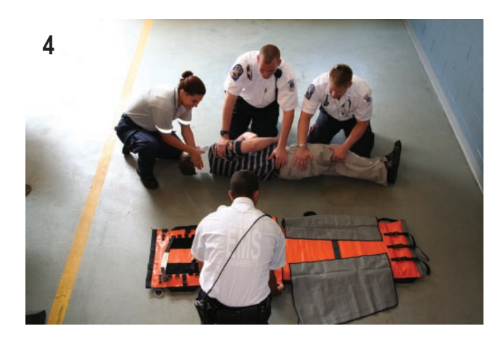
Maintaining cervical traction, roll patient as a unit. Slide REEVES SLEEVE under patient as far as possible.