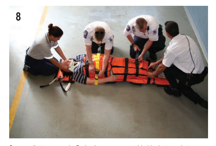
Secure all straps snugly. Patient's arms are outside black straps but may be placed inside yellow straps. Re-assess all procedures thus far.