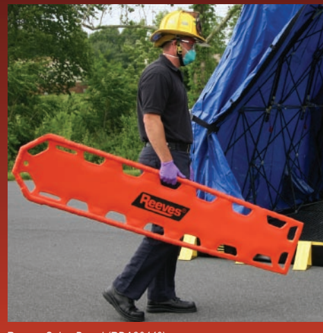
Reeves Spine Board (RDA30440)