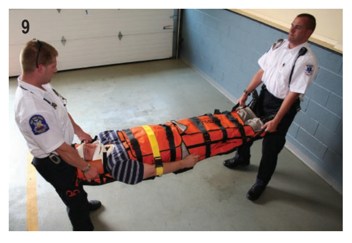
Your patient is now completely immobilized and ready for transport.