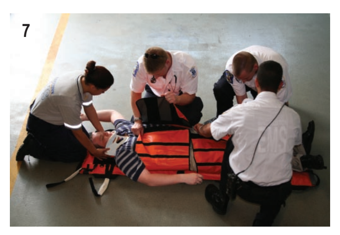
Place upper vest as high under arm pits as possible allowing no space in arm pit. Wrap upper and lower vests around patient and secure Velcro.