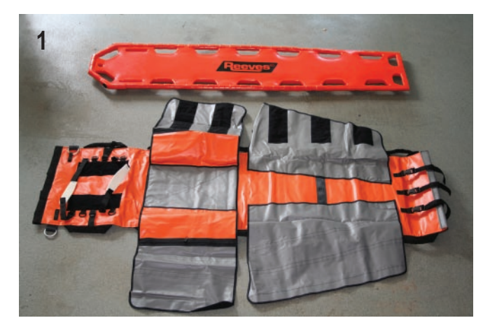
Remove REEVES SLEEVE from carrying case. Open vests and straps. Following a pre-application inspection, device is ready to use.