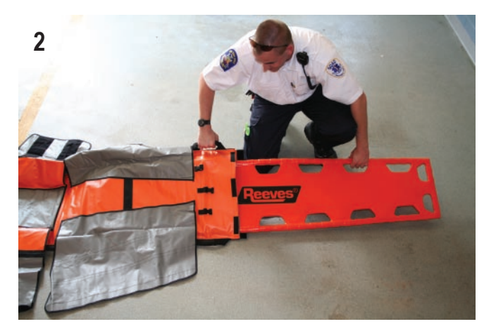
Open Velcro pocket at foot of REEVES SLEEVE. Slide supporting board into pocket. Re-secure Velcro and Fastex buckles of pocket.