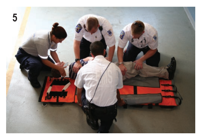
Continue to maintain cervical traction. Gently roll patient into centered position on REEVES SLEEVE.