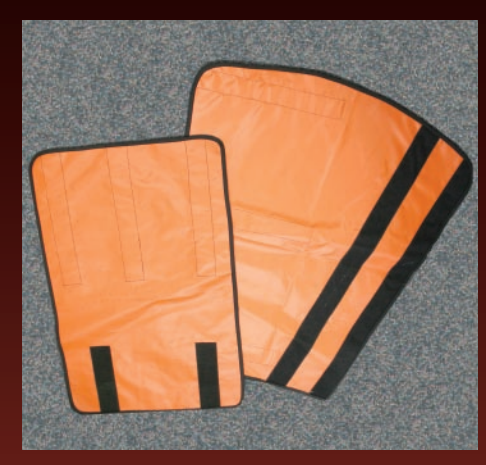
Reeves Sleeve Chest and Leg Extenders (RSS0050)

Replacement components include additional Head Blocks (RSS0026), Transport Bags [for both Black (RSS0054) and Orange (RSS0039) versions], Head and Chin Strap Sets (RSS0049), and Buckles.