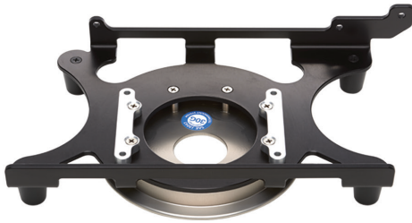
Bracket Pro Serie™ 35 Bracket Device Section Only (top view)