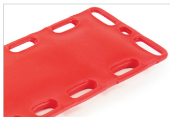
The Najo RediHold features two handles at tapered end to allow for more stable transport