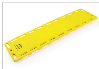
The Najo RediWide has an 18-inch width that facilitates patient rescues that require "more backboard"