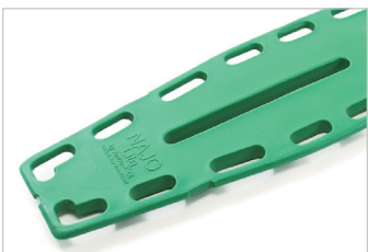
The Najo Lite Board is the lightest Najo backboard at just 14.5 lb