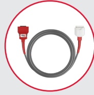
rainbow® RC-1 EMS Patient Cable > PN 4480