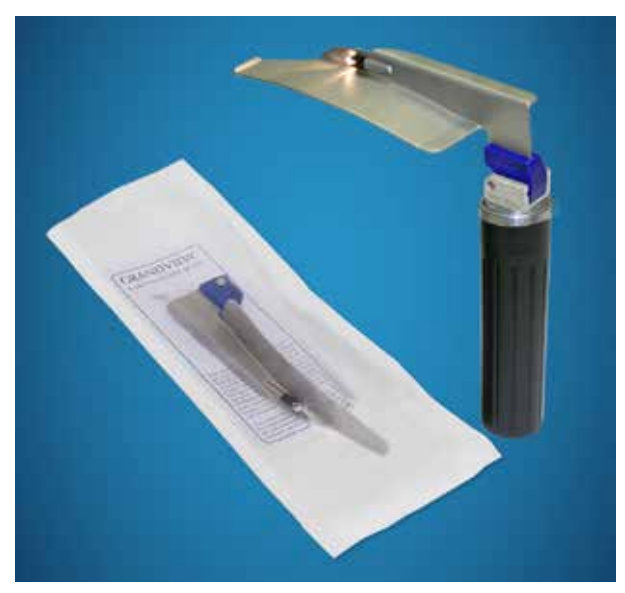
GV 2020A-DS Adult GRANDVIEW Disposable Blade Shown With BriteGrip Disposable Handle LB 1002-DS