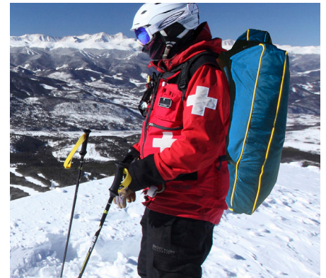
Optional backpack carry case available

The EVAC-U-SPLINT mattresses has six large padded handles secured to the perimeter of the mattress which provide improved security when moving and transferring a patient and also allows for rescuers to share handles when handing off a patient in tight quarters. The EVAC-U-SPLINT is filled with thousands of polystyrene beads which act as a thermal insulator to help maintain the patient's core body temperature decreasing the potential for hypothermia.