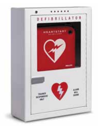
Premium Surface Mounted Cabinet ltem # PFE7024D

16.5" (42 cm) w, 15" (38 cm) h, 6" (15 cm) d