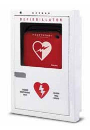
Premium Semi-recessed Cabinet Item # PFE7023D

16" (41 cm) w, 22.5" (57 cm) h, 6" (15 cm) d