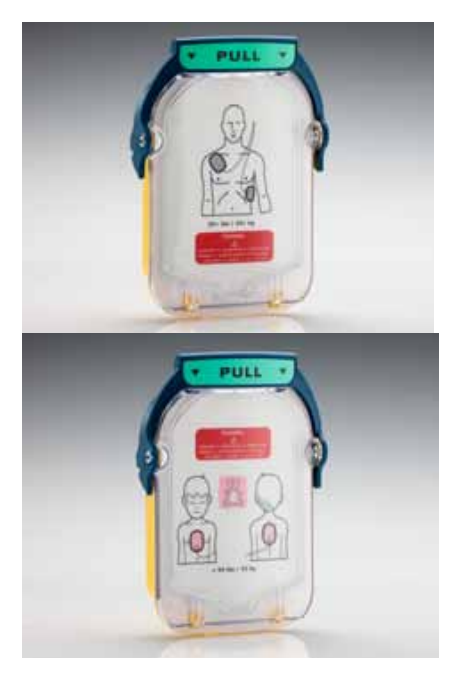
Training Cartridges Item # M5073A (Adult) Item # M5074A (Infant/Child)

To facilitate training on the OnSite Defibrillator, Adult and Infant/Child Training Pads Cartridges are available. These special purpose pads are installed in the HeartStart OnSite and the HeartStart Trainer. When installed in the OnSite, they suspend the defibrillator's ability to deliver a shock and activate its training mode, enabling the user to run any of eight emergency scenarios. Depending on which cartridge is used – Adult or Infant/Child – the defibrillator's voice instructions, including cardiopulmonary resuscitation (CPR) coaching, will be appropriate for treating the simulated victim.