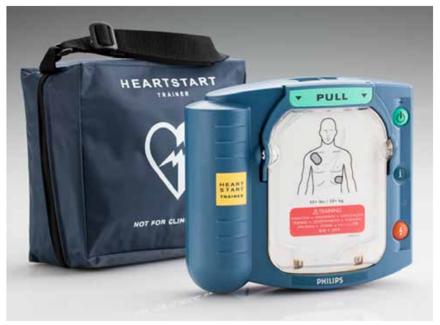
HeartStart Trainer Item # M5085A

Each training pads cartridge consists of a removable clear protective lid with a handle, a resealable film cover, and a pair of reusable adhesive pads.* It is packaged with a Pads Placement Guide (either Adult or Infant/ Child) and illustrated instructions for installing the cartridge, using the Pads Placement Guide, and repackaging the cartridge after using it. A training pads cartridge can also be used on a manikin, connected with an internal (M5088A) or external (M5089A) manikin adapter.