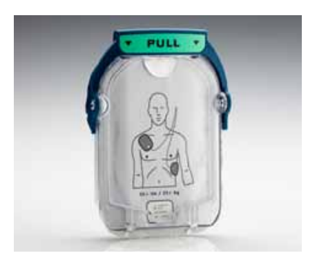
Adult SMART Pads Cartridge Item # M5071A

HeartStart Adult SMART Pads are appropriate for cardiac arrest victims weighing 55 pounds (25 kg) or more.