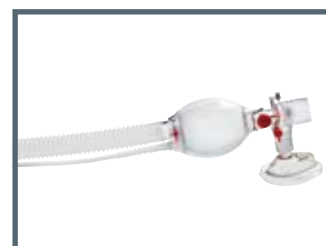
SPUR II infant with tube reservoir