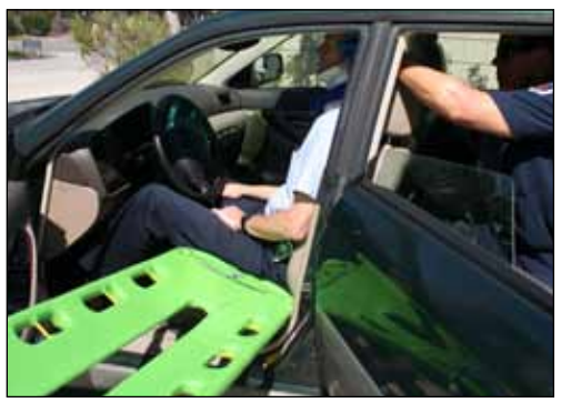
Tapered ends to simplify extrication