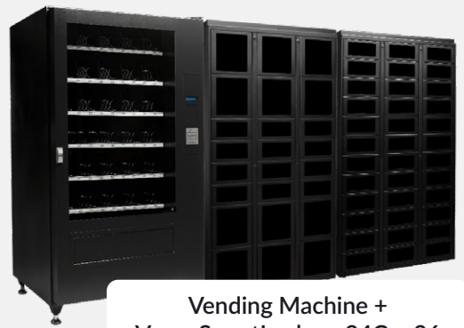
Vending Machine + Versa SmartLockers 24C + 36

There are hundreds of ways to deploy smart lockers. Configure your smart lockers to work in tandem with a master vending machine, or keep your installation locker-only. As a standalone configuration, our system can handle a bank of lockers with 120 bays. Or, if you add a vending machine, you can configure your lockers with up to 60 bays.